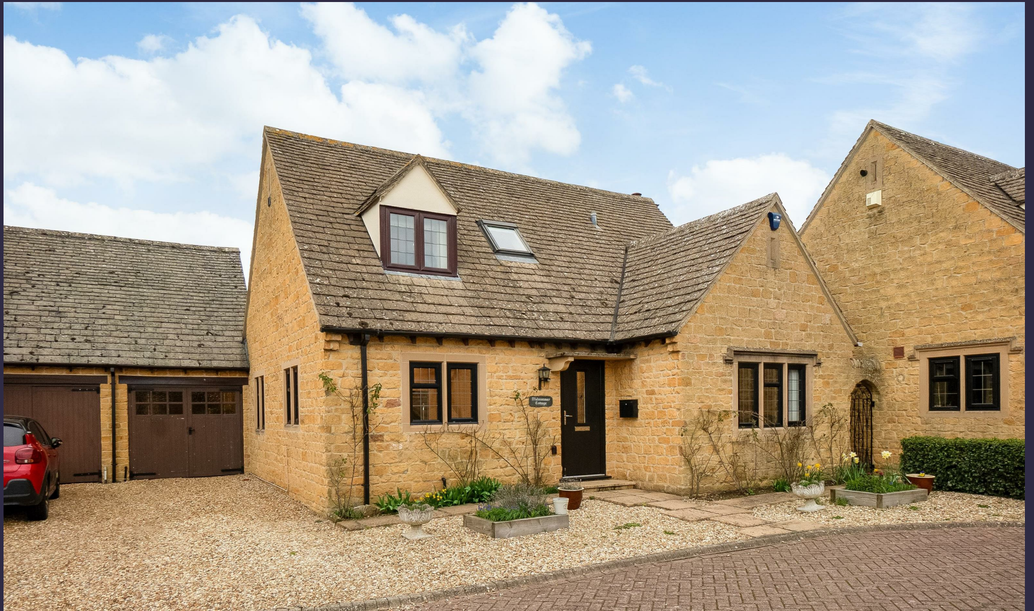
5 Wheatfield Court, Mickleton, Chipping Campden, GL55 6UA